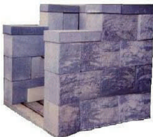
Concrete Barbeque with screen, chimney and non combustible base

More Details visit : http://www.bridgewater.ca/building-and-fire-inspections/burning-by-law.html