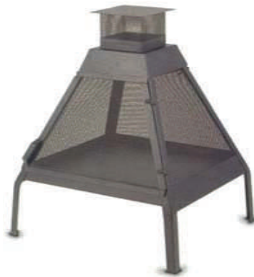
Commercially available outdoor wood burning fireplace.