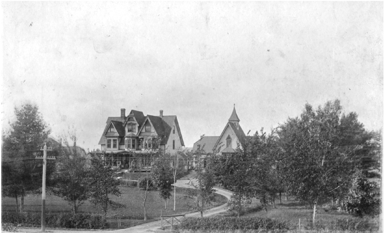
Davison House, 95.4.9 DBP3B C. 1890