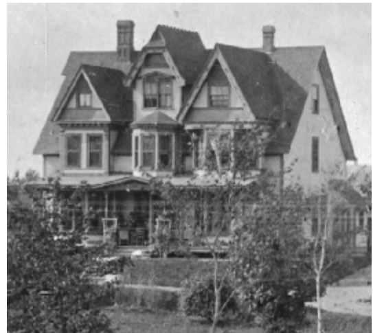
Davison House, 95.4.9 DBP3B C. 1890 The home of Frank Davison in detail. Built around 1889

His home is a gracious and stately house located on Aberdeen Road. It is both impressive in its architectural detail and imposing in its size. Constructed in the Late Victorian Modified Gothic style in 1889, 16 the house has three large dormers on the front of the home, each measuring a different height and a different size. The right dormer is the widest and has a gabled roof and a three sided recessed bay window just above the veranda. Ornamental brackets support a decorative shelf complete with a circular designed bargeboard and dentils just below it. The pedimented dormer sits over the recessed bay window and is trimmed in the same circular designed moulding as the shelf below it. Just below the small window is a scale shingle design.